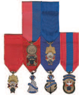
Diagram 6 Past State Deputy Former Vice Supreme Master Former District Master Former District Deputy Past Grand Knight Past Faithful Navigator