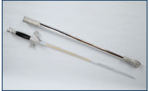
Black Handled Sword with Scabbard